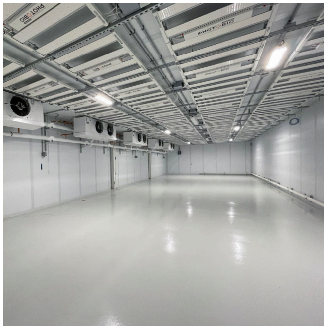
Grow Room Fit-Out by GC with GC IMP & Dehu using Reheat Coils

The GC-20 Mesh LED Light Controller connects to a Bluetooth® mesh network and controls a group of lights using a 0-10V dimming and a relay output. Day/Night Times are programmable through the GC-20 Mesh, as well.