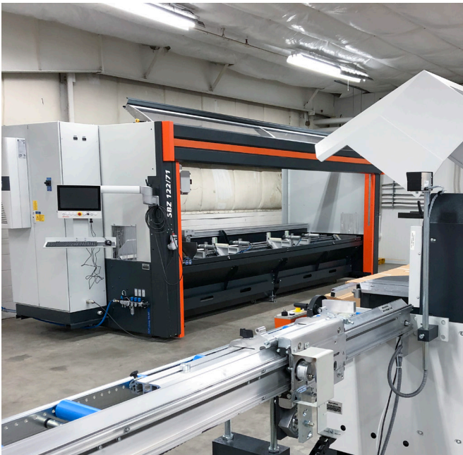
Growtight Door Manufacturing at GC Headquarters in Michigan