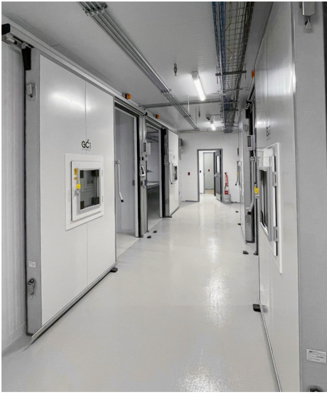
Sliding Growtight Doors in Grow Facility Hallway